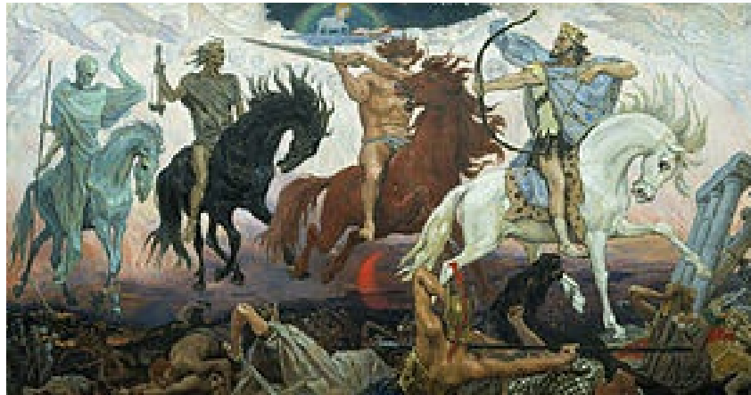
Four Horsemen of the Apocalypse , an 1887 painting by Viktor Vasnetsov. From left to right are Death, Famine, War, and Conquest; the Lamb 1 is at the top.

PLANETARY DISASTERS: The vision of the United Nations is explicated within the 17 Sustainability Development Goals (SDGs) for 2030. These interventions, we are told, can destabilize the plagues that now threaten the planet. Such plagues are explicated within the well-known metaphor of the “ Four Horsemen of the Apocalypse ”—portents found variously within the Book of Revelations 2 , the Bhagavatam Puranas: 2.21:1-5; Hopi Prophecies, 3 and the Old Testament of both Christian and Jewish traditions—and other texts. All portend existential disruption at the end of days because of mankind’s careless and evil deeds. One might look at the 17 UN-SDGs as warnings about such scourges for all earthly life forms.